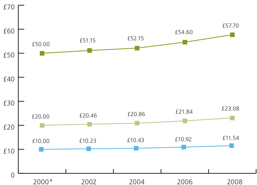
Figure 2 The change required in the value of a donation to keep pace with CPI inflation, 2000–2008

To keep pace with inflation, the savvy donor would need to donate £11.54 in 2008 for it to have the same value as £10 donated in 2000 (see Figure 2). For a £50 donation the increase is even greater: a donor would need to give £57.70.