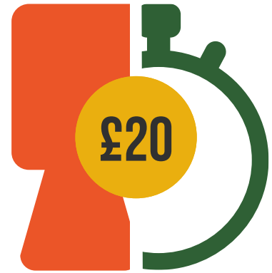
Median amount donated/sponsored in the four weeks prior to interview